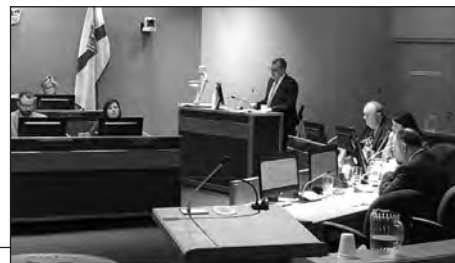
As President of Nova Scotia Federation of Municipalities I get to speak to many municipal councils, like in January when I presented to Cape Breton Regional Council.