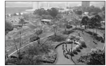
The Northern Gateway at Barrington and Cornwallis looking south

also details the construction phases for the project. Significant public feedback was used to inform the 90% design. From August through October 2018, input was sought on two topics: public spaces and urban design rules for new buildings in the Cogswell District.