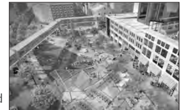
Granville Square, a new park north of where Granville Mall currently ends.

Additional information can be found at: https://www.halifax.ca/about-halifax/regional-community-planning/construction-projects/cogswell-district/cogswell-district-redevelopment