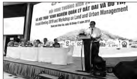
I had the tremendous honour of representing Canada and Nova Scotia at the Association of Cities of Vietnam Annual Meeting in Vung Tau, where I gave a keynote on property tax.