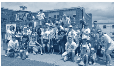
Halifax Mayor, Councillors, staff, families and allies ready to walk in the 2016 Pride Parade!